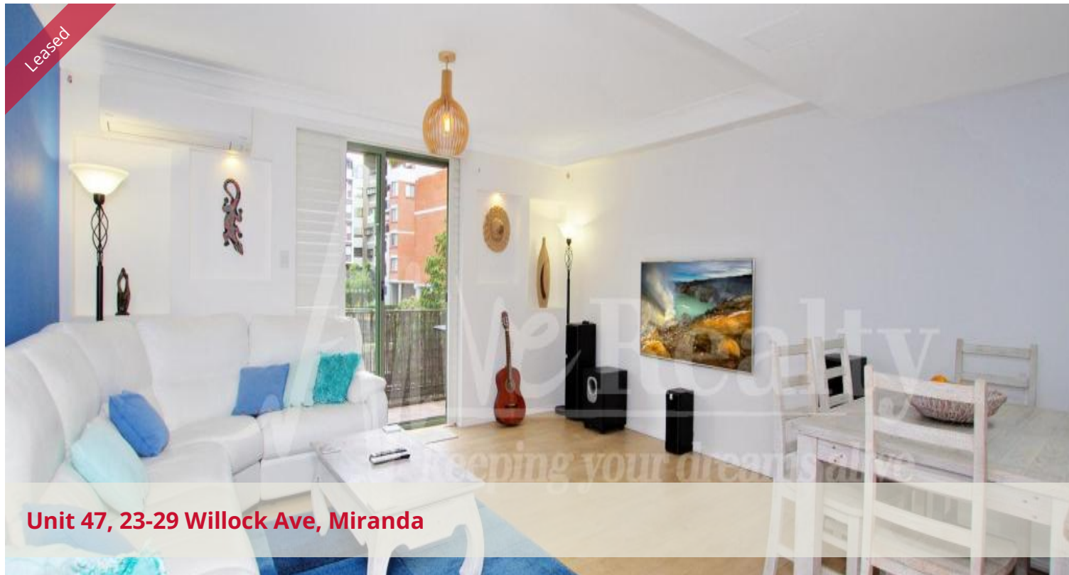
Unit 47, 23-29 Willock Ave, Miranda