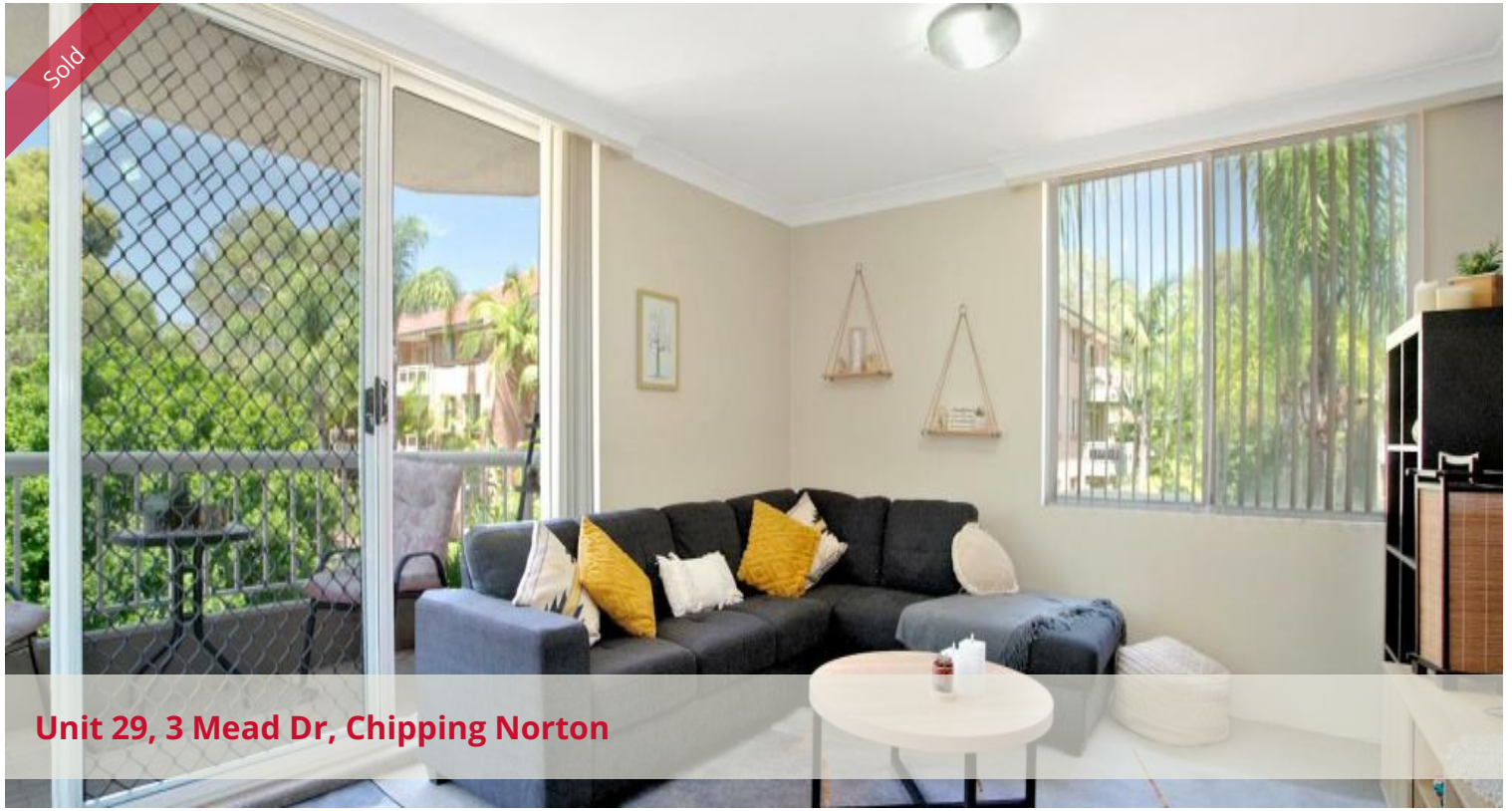
Unit 29, 3 Mead Dr, Chipping Norton