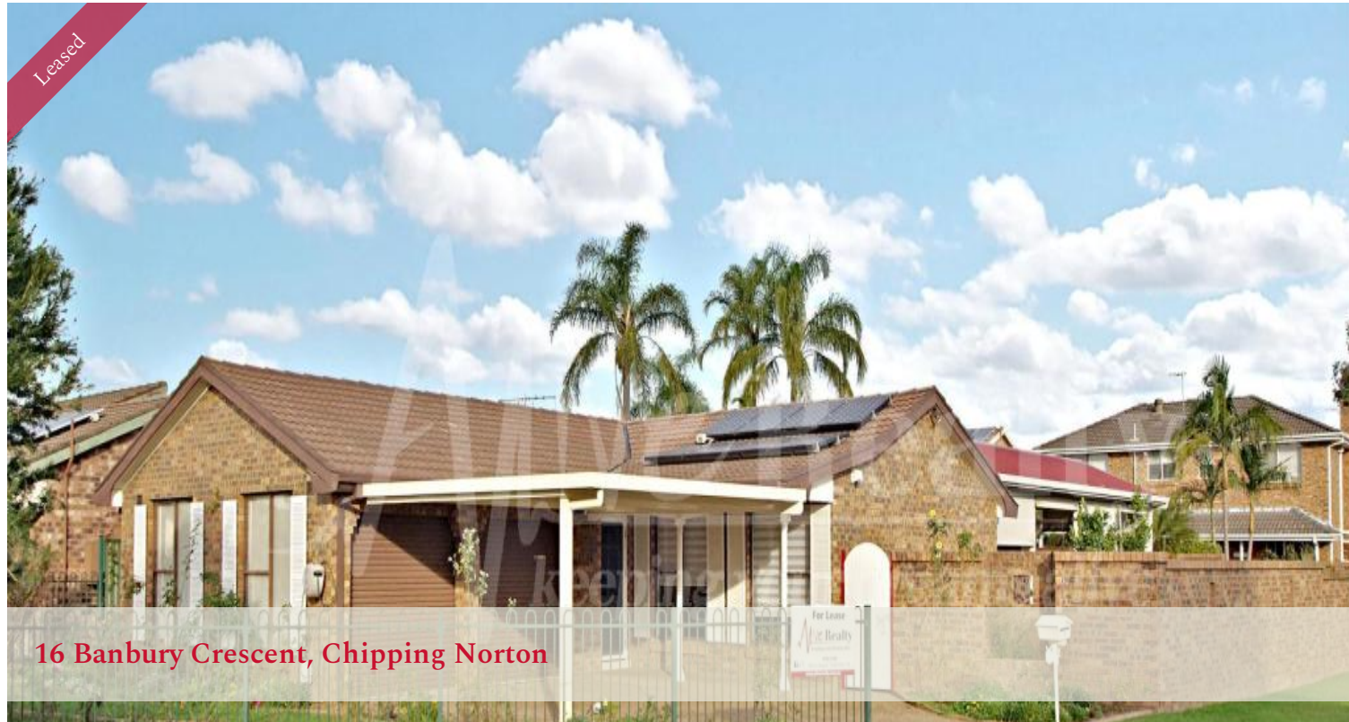
16 Banbury Crescent, Chipping Norton